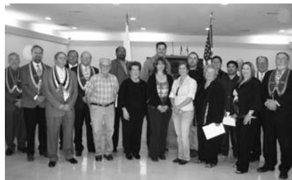
Newly initiated members to Arrowhead Parlor #110

Following the initiation, a Grand Parlor and Arrowhead Parlor #110 joint dedication of the Orange Show Event Center was held in recognition of its 100th Anniversary.